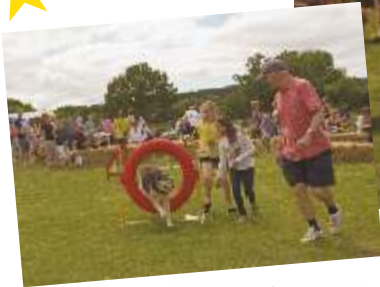
DOG AGILITY COURSE