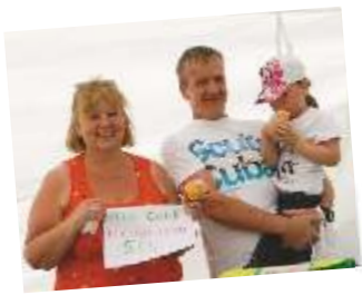
CAKE DECORATING CLASSES