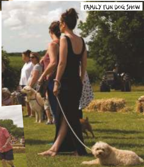
FAMILY FUN DOG SHOW