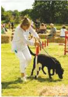
THANKS TO PAULINE FOR ALL THE WONDERFUL PHOTOS