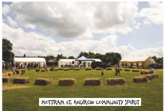
MOTTRAM ST. ANDREW COMMUNITY SPIRIT

A GREAT BIG THANK YOU TO ALL THAT HELPED OUT TO MAKE THIS COMMUNITY EVENT TAKE PLACE.